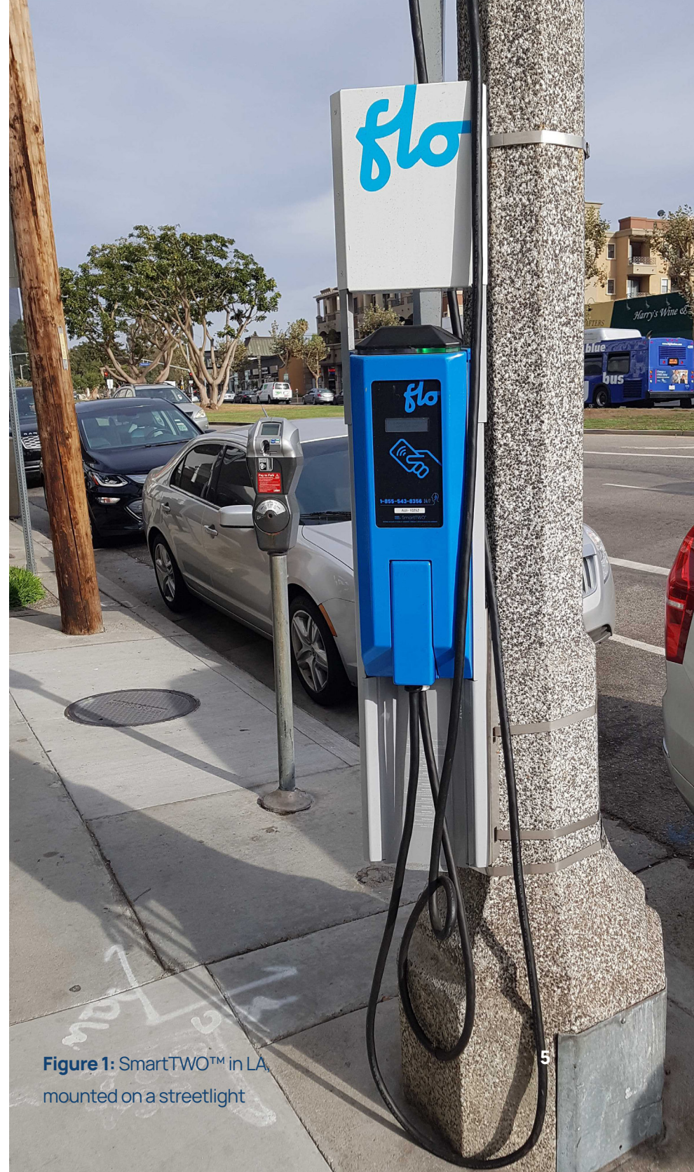
Figure 1: SmartTWO™ in LA mounted on a streetlight